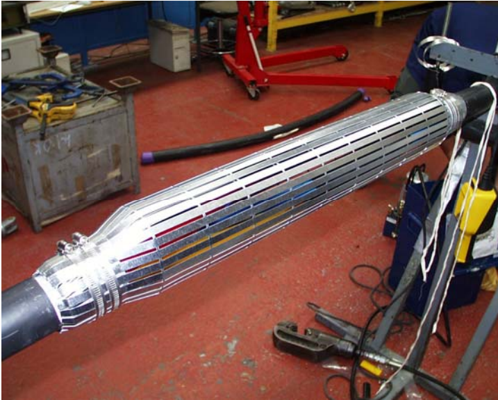
1. Standard LV joint